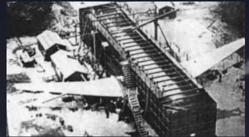
Comet Subjected to experimental fatigue loading

To find out the root cause of the failure, a comet was subjected to full-scale flight simulation testing at Farnborough. The fuselage was subjected to hydraulic pressure in cycles and the wings were flexed using jacks to simulate the real time flight loads. After 1836 simulated cycles, a 2mm crack was detected near the escape window, which would eventually rupture the cabin wall.